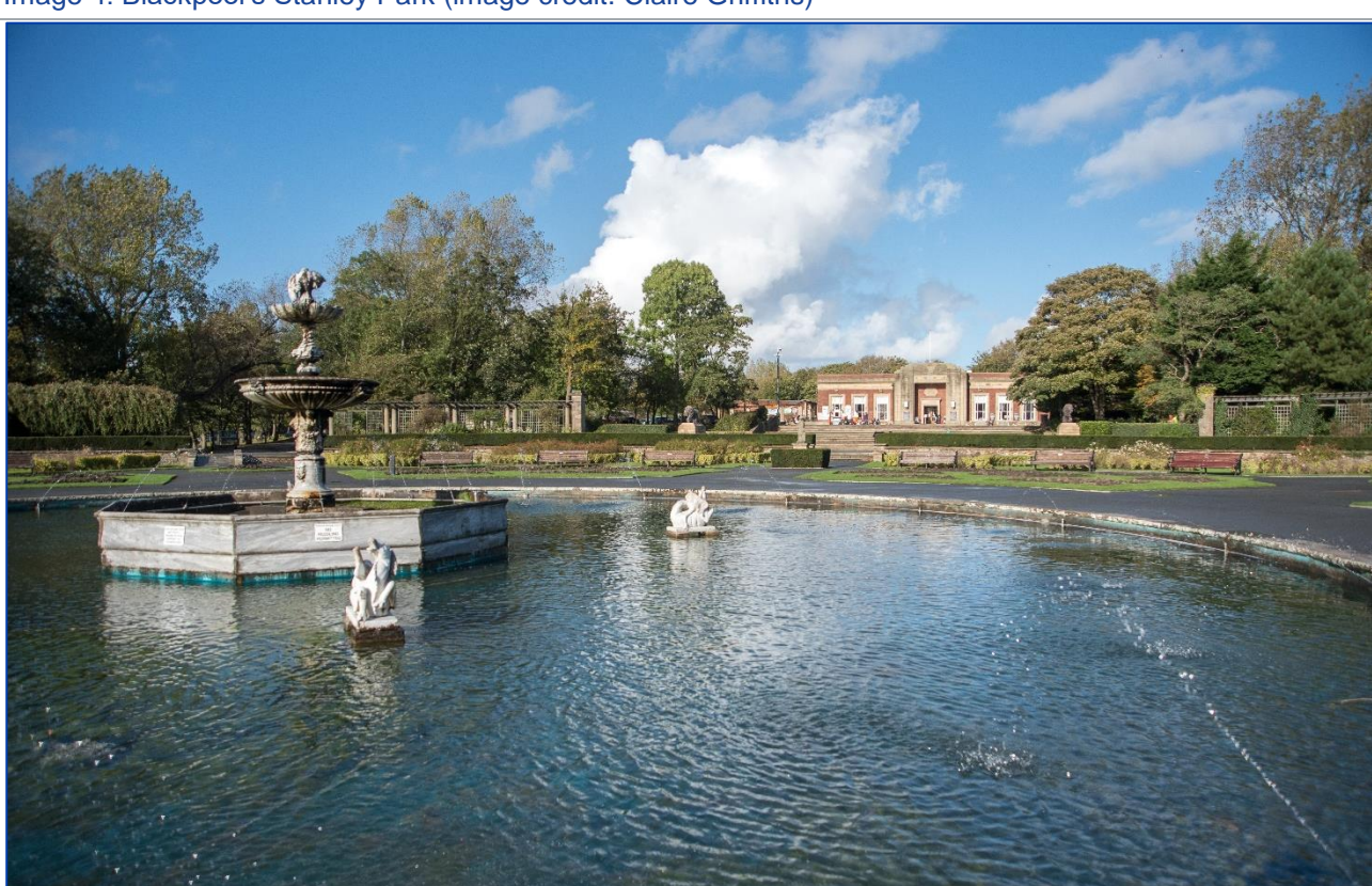
Image 4: Blackpool's Stanley Park